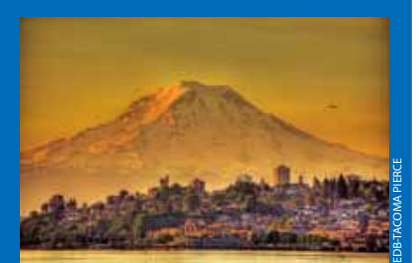
Mount Rainier in Pierce County

Pierce County, and its largest city, Tacoma, are centers of business innovation. It is home to more than 70 aerospace companies, which moved there to take advantage of the abundance of resources and talented workers. Japanese logistics powerhouse Mitsui-Soko is one of the newest additions to the region's aerospace industry. Toray Composites, the innovative leader in industrial composites, recently completed a multimillion-dollar expansion of their production facility. The county is also home to developers, as well as manufacturing and industrial companies.