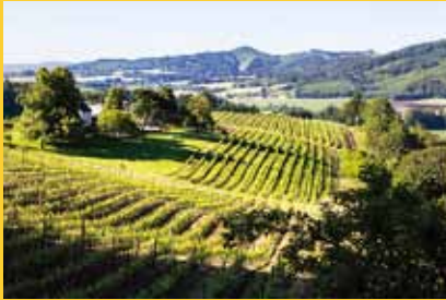
David Hill Vineyard in Tualatin Valley

These and many more adventures are waiting here in Tualatin Valley, Oregon. It's easy to get here; Delta Airlines offers regularly scheduled non-stop flights from Narita Airport near Tokyo to Portland, Oregon. ■ → visittualatinvalley.com